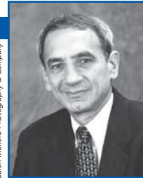
Sarah Merians Photography & Company